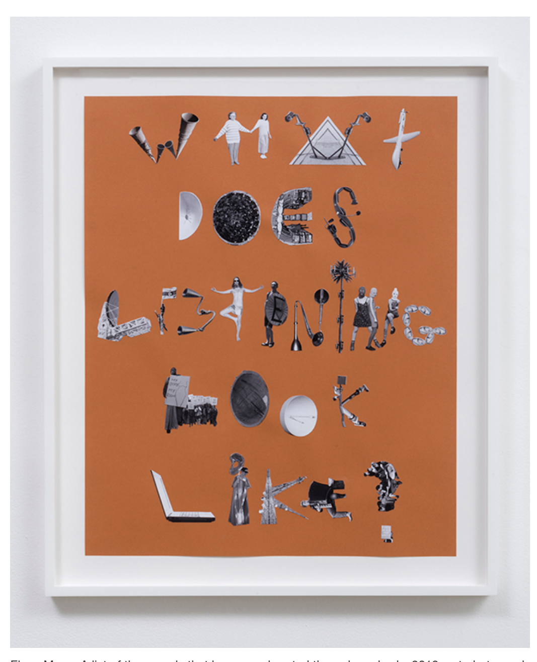
Elana Mann, A list of the sounds that have reverberated through my body, 2013, cut photographs on paper, 18" \times 24"